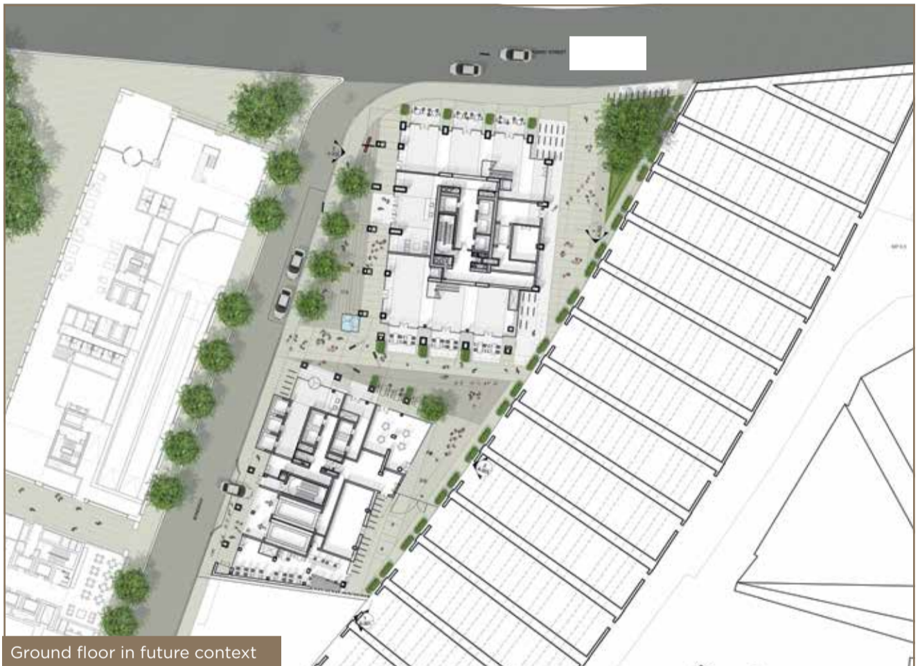
Ground floor in future context