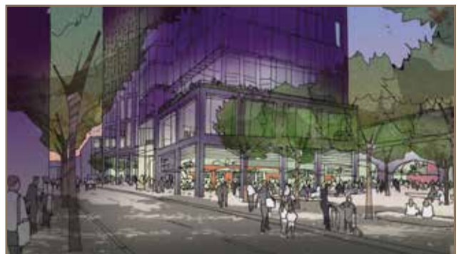
Bondway Street - future vision