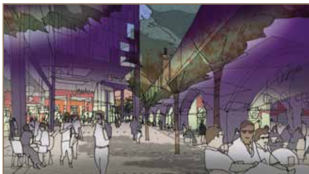
Backyard with active retail arches - future vision