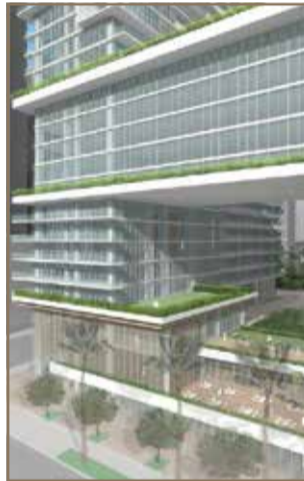
Oasis in the Sky