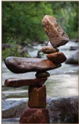
Composition of Balance

The nature of the design also allows additional areas for indoor amenity rooms, an office atrium and residential winter gardens.