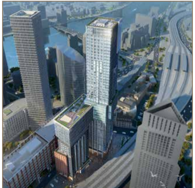
Axonometric of the Proposal